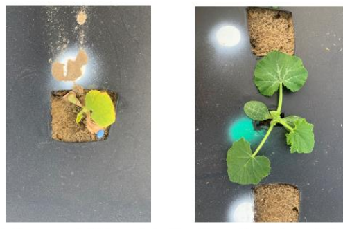
*Mulch was washed after applying Roundup and before transplanting.

Fig 3. Residual activity of Roundup if plant lands in "old" hole vs. a "new" hole.*